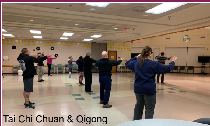
Tai Chi Chuan & Qigong