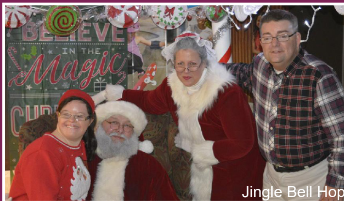
Jingle Bell Hop