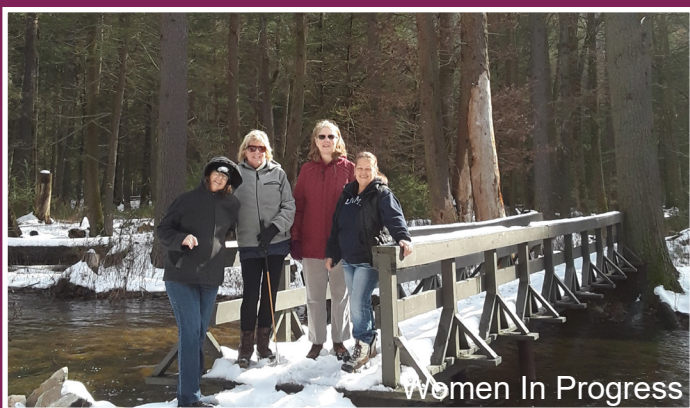
Women In Progress