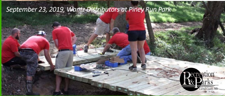
September 23, 2019, Wartz Distributors at Piney Run Park