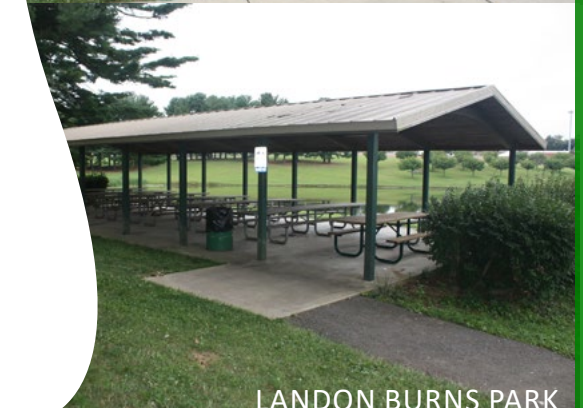
LANDON BURNS PARK