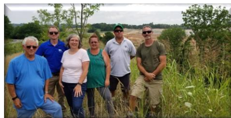
Lehigh New Windsor Quarry & Conveyor Belt Tour, July 14, 2017