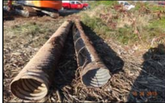
Photograph of a deteriorated metal pipe.

The County maintains about 180 miles (or 950,000 feet) of storm drain infrastructure, mostly located in neighborhoods where curbing and inlets exist. Many of the storm drain systems were constructed in the late 1960s and 1970s and may be reaching the end of their useful life.