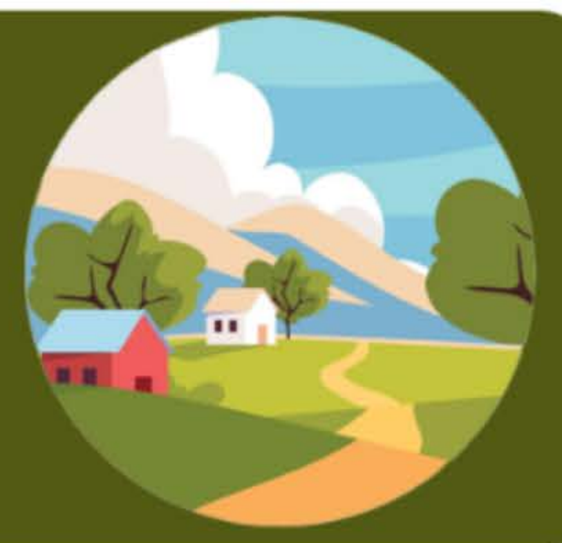
Ag. Preservation Yearly Funding 1980-2024