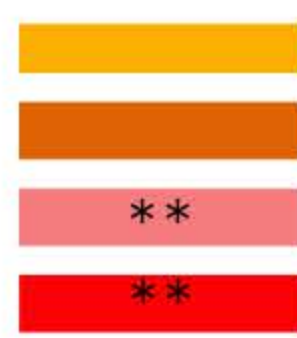
MULTI-FAMILY DWELLING (Condos and Apartments)