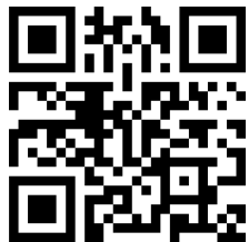
Photo ID required. Allow one hour for your donation. *While supplies last. Must complete screening process to receive giveaway.