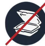
NO HINGED CONTAINERS OR PLASTIC BINS (such as produce bins, berry boxes, take-out containers)