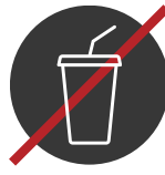
NO STRAWS, BEVERAGE LIDS, OR DISPOSABLE CUPS