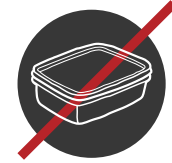
NO BAKERY, DELI, SALAD, OR FROZEN MEAL TRAYS, ETC.