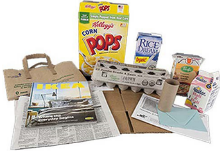
Paper, cartons, and cardboard (clean and dry)