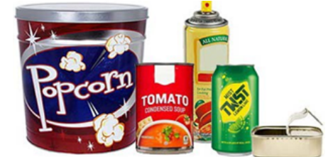
Empty aluminum and steel cans