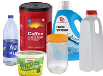
Empty bottles, tubs, jars, and jugs (leave lid)