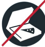
NO SOILED CARDBOARD OR PAPER (such as pizza boxes)