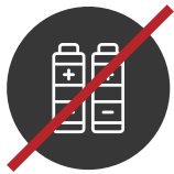
NO BATTERIES OF ANY KIND