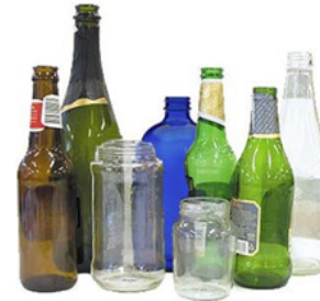
Empty bottles and jars (all colors, remove lid)