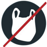
NO PLASTIC BAGS OR FILM Return to retail drop-offs.