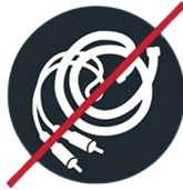
NO "TANGLERS" (such as hoses, cords, chains, holiday lights, rope, twine, textiles, etc.)